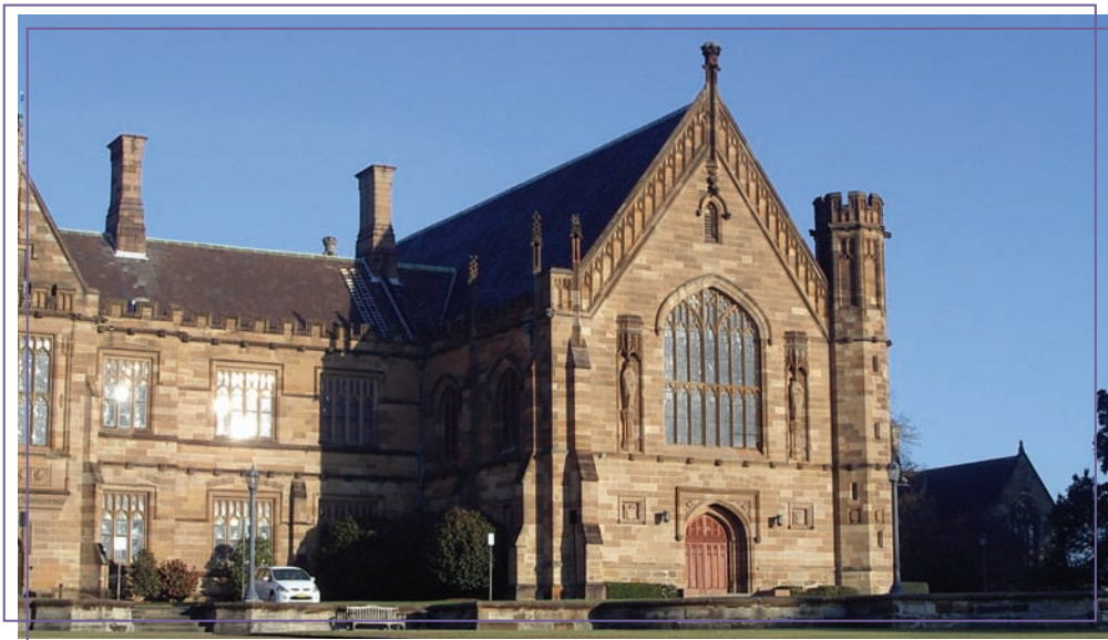
University of Sydney, Great Hall

For more information about graduation ceremonies, please contact the Board on (02) 9338 3506.